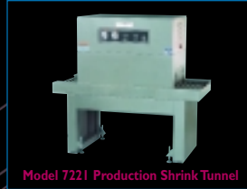
Model 7221 Production Shrink Tunnel

Your one source for heat sealing and shrink wrap packaging machinery